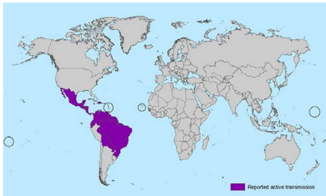
Figure 1. Zika virus spread . Centers for Disease Control and Prevention February 25, 2016.

In May 2015, the Pan American Health Organization (PAHO) issued an alert for the first confirmed patient in Brazil. A significant increase in reported cases of microcephaly has occurred simultaneous to spread of the virus in Brazil. Many countries in Central and South America, the Caribbean, and U.S. Territories report local transmission of the virus. Zika virus is not currently being transmitted by mosquitoes in the continental U.S., but there have been cases reported in travelers who visited affected countries and there is active transmission in American Samoa, Puerto Rico and the U.S. Virgin Islands ( CDC, 2016 ). Though we cannot predict how widespread cases of Zika virus may be in the continental United States, recent chikungunya and dengue outbreaks indicate that we are not likely to see the same type of rapid spread Zika virus infection currently occurring elsewhere. Local transmission of the virus is anticipated to be small and focal.