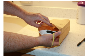
9. Upon return remove 95 from bag, being careful not to touch inside of mask.