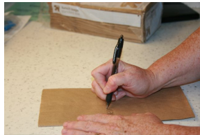
5. Get paper bag, write your name on bag leave on counter, and enter patient room