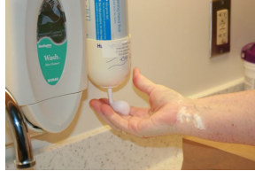
2. Or use alcohol rub if hands are not soiled