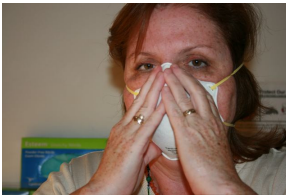
4. Put on mask and fit check