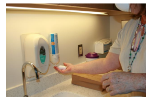
12. Hands are contaminated, perform Hand Hygiene

Never use a N95 respirator for longer than one shift! Employees are not required to reuse respirators. Staff should use the N95 respirators for which they were fit tested.