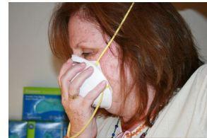
6. After exiting patient room remove N95