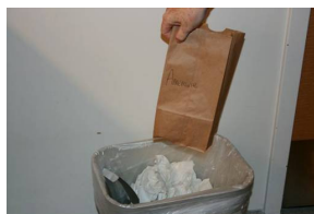
11. Throw away bag after one use