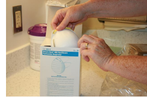
3. Take out new mask