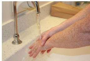
8. Hands are contaminated, perform hand hygiene