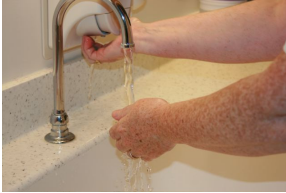
1. Wash hands

N95 may be reused until crushed, soiled, wet or difficult to breathe through