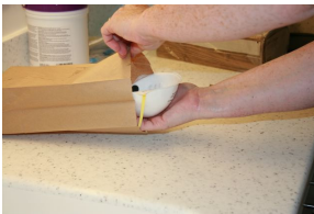
7. Insert N95 for later reuse